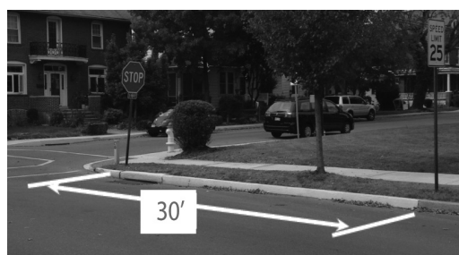
The curb is painted yellow to denote a distance of 30 feet, the statutory distance to restrict parking on the approach to a stop sign.

or improve safety for pedestrians or vehicles. These restrictions require signs. However, curb markings remain optional . If curb markings are used to convey parking regulations in areas where curbs are frequently obscured by snow and ice accumulation, signs must be used with the curb markings for non-statutory parking restrictions.